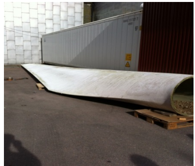
Figure 4: Vestas V47 blade at the Chalmers Cold Climate Lab

During the extension of the project the specifications for the test object to be used in experimental set up in Cold Climate Lab based on rotor blade of Vestas V47 have been developed and the analysis of available actuation and sensing transducers to be chosen for a new experimental set has been done. The test object, used rotor blade of Vestas V47, was received at the end of September 2014 from Connected Wind Services (Figure 19).