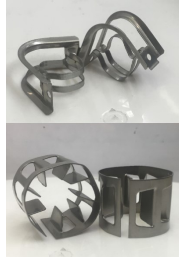
Random packings with high void factor. Thread saddle (top) and pall ring (bottom)

We have recently performed experimental studies about various aspects of fundamental fluidization properties (gas-solid mass transfer, pressure drop, solids through-flow, heat transfer) for packed-fluidized beds, resulting in several scientific papers and reports. The proposed project involves follow-up and continuation of this effort. Detailed characterization of slugging, and inhibition thereof, by use of random packing with high void factor is one topic that would be exiting to examine closely. Solids through-flow of particles for packed-fluidized bed with such evolved packing material is another topic that could be considered. These phenomena can be studied experimentally in plexiglas cold-flow fluidized-bed reactor. The project will utilize a proven reactor setups and methods previously used for other kinds of fluidization experiments.